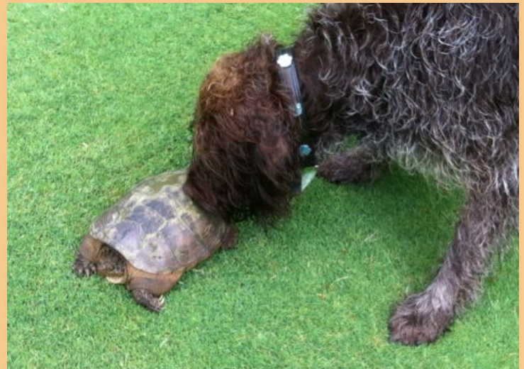
Fur meets scales: BMP residents Karen and Andrew Manidis' dog, Abby, has a very close encounter with the proper (safe) end of a nomadic common snapping turtle on the Preserve.

Inspired to help these Cretaceous cuties? Consider putting some temporary gap fencing around nests in your yard, but check them daily come August and always scan the yard before mowing. Never put yourself at risk to help an animal in the road, but if you're able to assist, please do! Just be sure to watch your fingers! It's safest to push it from behind with a stick or broom. Other smaller turtles such as the Eastern Box Turtle are also making journeys to new habitats during nesting season, so please drive slowly and be on the lookout to help these animals across the road (in the direction they are going) when you can. Turtles are territorial, so please do not relocate them to a different place. (Editor's note: moving turtles out of the area in which they're found can also spread disease into new populations.)